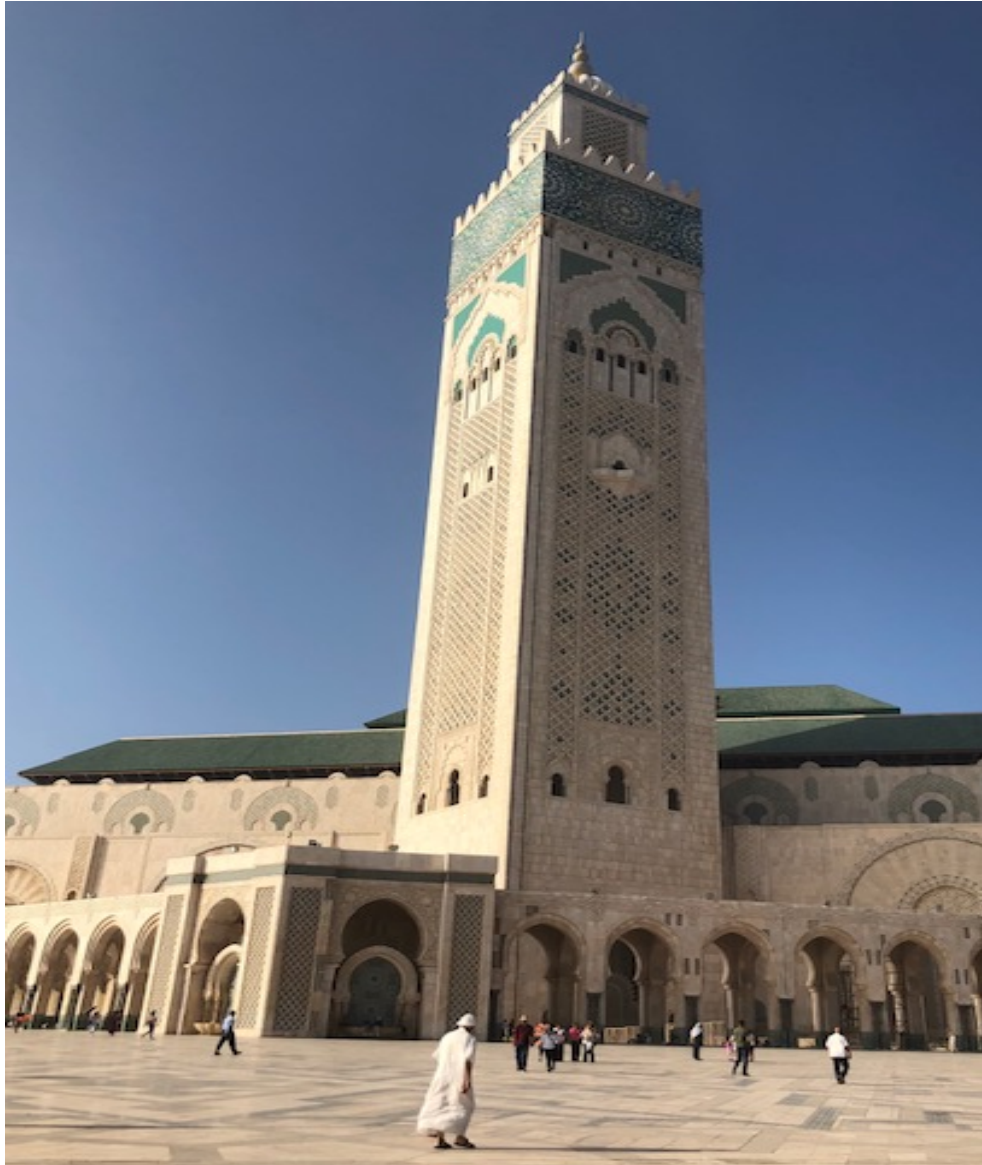
Hassan II Mosque, Casablanca